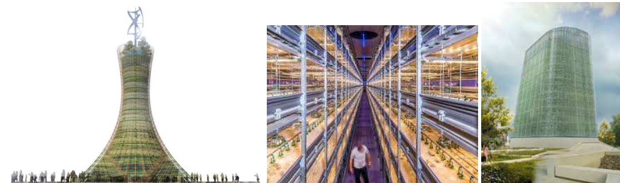
Figure 1: A Skyfarm hyperboloid tower (left) that harnesses solar energy and wind power and collects rain water to grow food (Vyas, 2018), a vertical system of broiler production in the Netherlands (middle; Viviano, 2017), and the Plantscapers system developed by Plantagon that provides space for homes and offices and food production (right; Vyas, 2018).

2 Range accounts for a pig weighing from 5 to 100 kg.