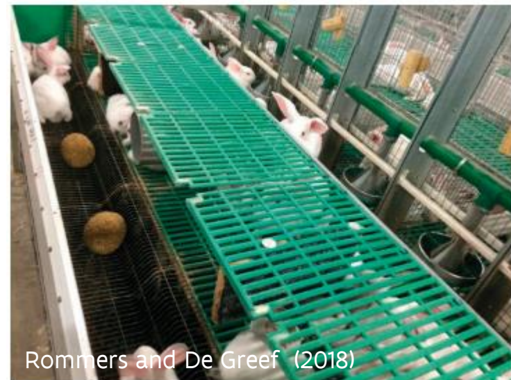
Rommers and De Greef (2018)