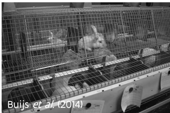
Figure 1 Housing systems. Top: a semi-group pen divided into four individual units (as used from 3 days before 18 days after kindling), middle: a semi-group pen with grouped does (as used from 18 days after kindling to 3 days before next kindling), bottom: a row of individual cages.